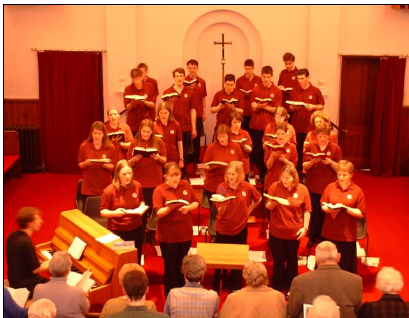
Congregational hymn during the Haxby and Wigginton concert

Early on Saturday morning, with a few bleary eyes and none-too-alert minds, we set about learning some new relatively new