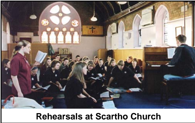
Rehearsals at Scartho Church

held written by some choir members who clearly watch too much TV and listen to far too much pop music. It was very enjoyable and there were even prizes.