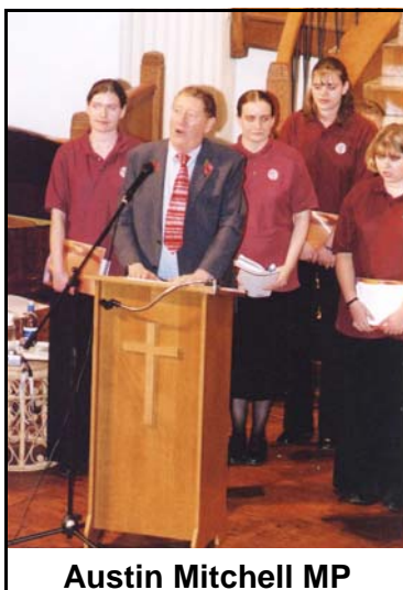
Austin Mitchell MP